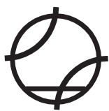
3-Channel Rotor Type 3