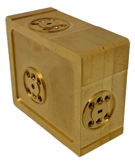
29785 Full-band OMT using FSM-45 flange interfaces

Flann full-band OMTs offer the high performance demanded by today's communication systems, in which good polarisation purity and isolation are paramount. These instruments have two rectangular ports on adjacent faces, and a common circular port.